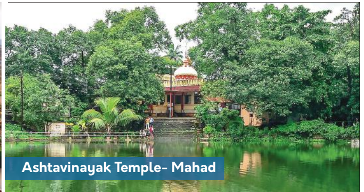
Ashtavinayak Temple- Mahad