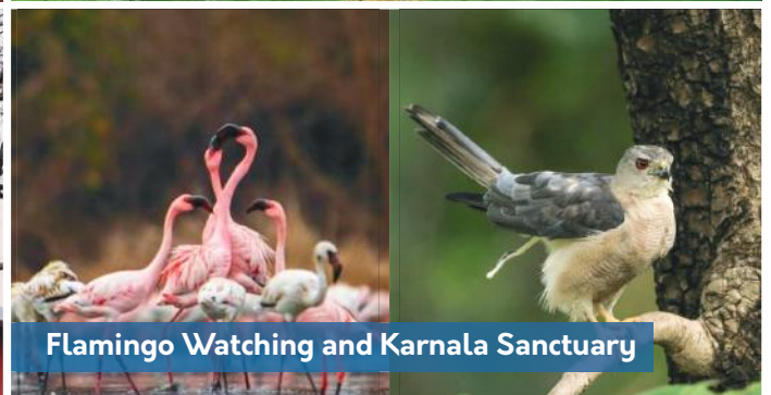
Flamingo Watching and Karnala Sanctuary

Conference Secretariat: Medivision Infomedia Pvt. Ltd., 2, Neelkanth Niwas, Purandare Park, Dr. B. A. Road, Dadar T. T. Circle, Dadar (E) Mumbai - 400 014. Phone: +917021696648 Email: info@mapcon2019.com • Website: www.mapcon2019.com